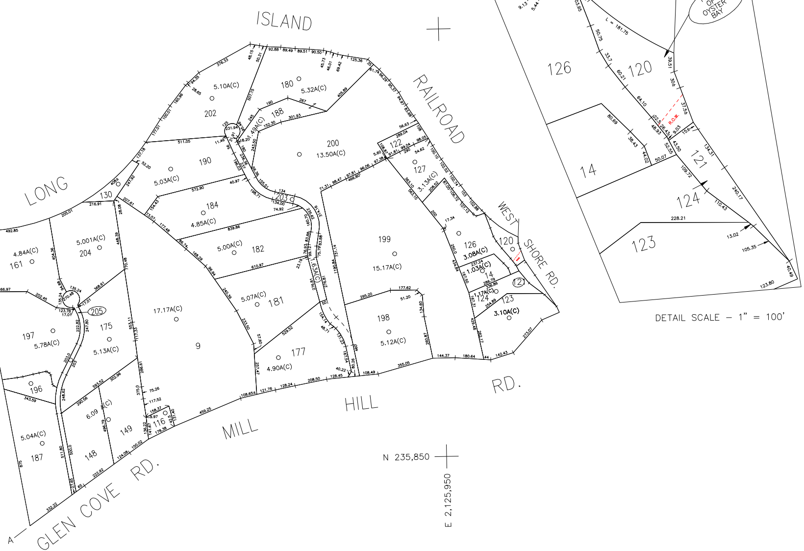
DETAIL SCALE - 1" = 100'